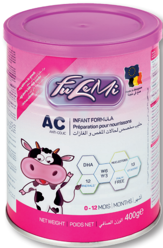
FULEMI AC Anti-colic

These milk formulas are specifically designed to meet the nutritional needs of infants with common symptoms in the first age (0 to 12 months).