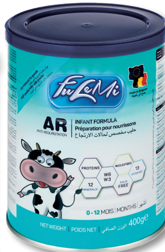
FULEMI AR Anti-regurgitation