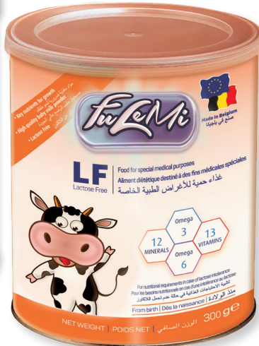
FULEMI LF Lactose-free